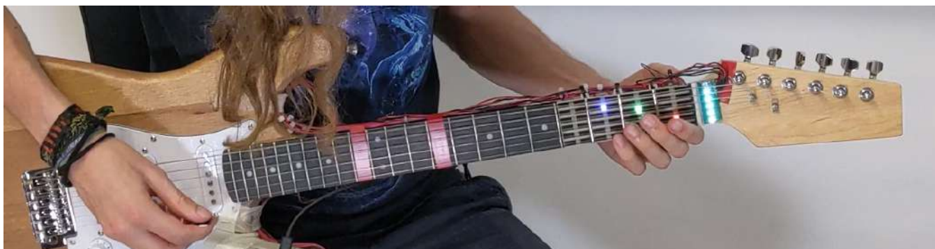
Figure 1: We present Let's Frets , a modular guitar learning concept with three feedback modules: (1) visual indicators, (2) finger position capturing, and (3) a combination of both modules.

Max Mühlhäuser, and Thomas Kosch Technical University of Darmstadt, Germany