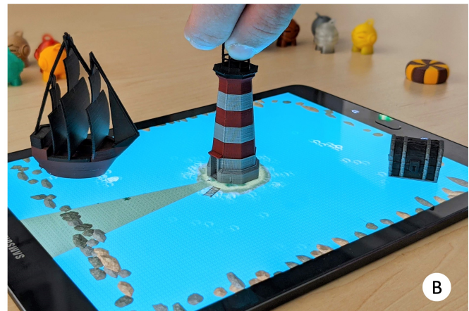
Figure 1: (A) Multi-material component during the 3D printing process and (B) an electrical functional 3D printed multi-material component in use in an interactive board game.